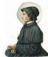
Court Mother Seton #2119